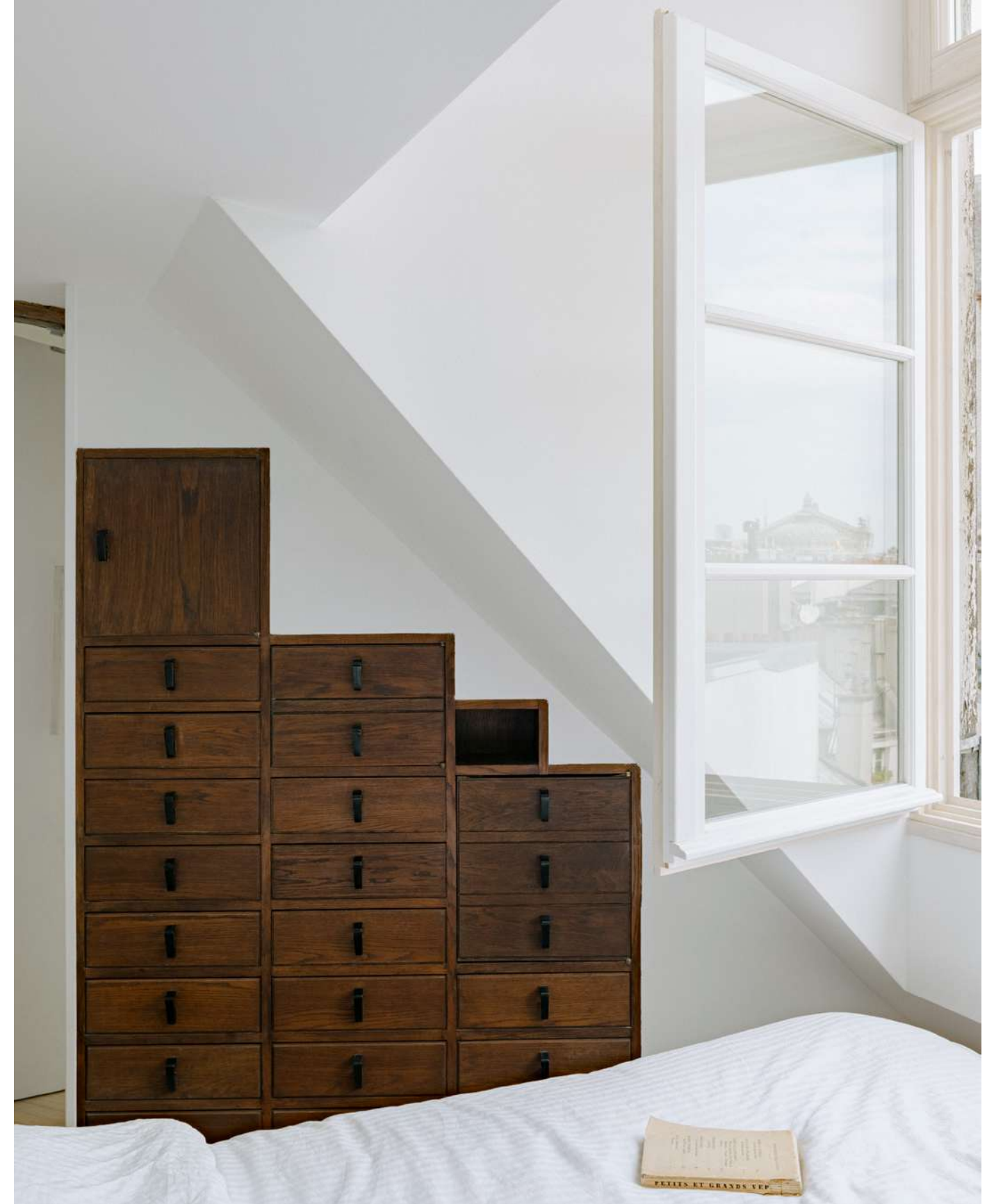
Left The neighboring dome in all its glory. Right Carefully chosen antiques work within the limitations of the historic building.