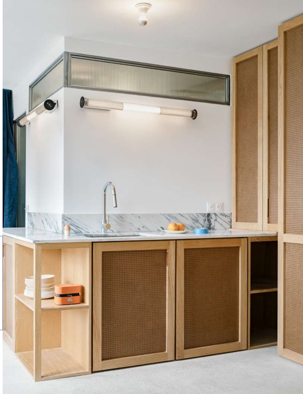
Top Left The kitchen is simple, with wooden cupboards and a marble countertop. Bottom Left Glossy zellige tiles add sensuality to the bathroom. Right Reeded glass walls keep the bathroom private.