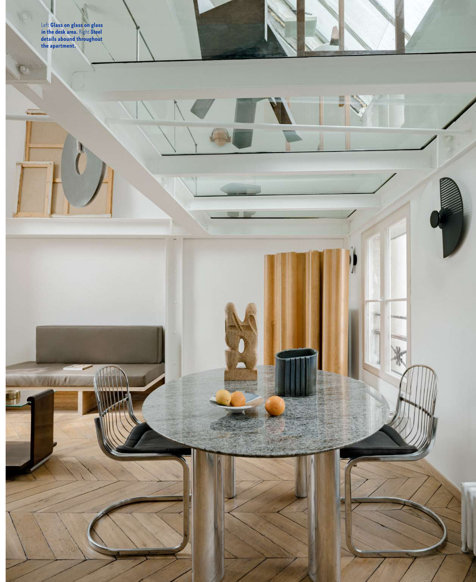
Left Glass on glass on glass in the desk area. Right Steel details abound throughout the apartment.